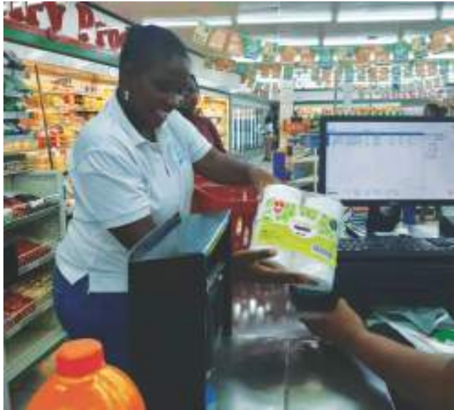
A client buying a packet of four rolls Xuuxoo toilet paper at Letlhakane Choppies Store

In a historic step, we saw our first product hitting the big market. Xuuxoo toilet paper locally produced in Boteti, in a dusty village of Rakops made a mark by being the first poverty eradication product to be listed in one of the big supermarkets being Choppies Group of Companies in Botswana. This toilet paper is produced by local 6