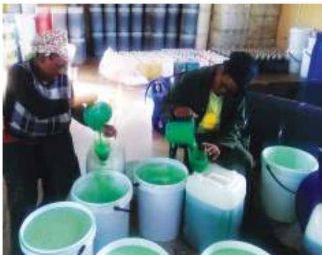
Packaging of Multi-detergents by beneficiaries in Goodhope-Mabule