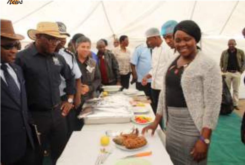
Food tasting during the Fisheries market day by Minister Arone Bagalatia and Assistant Minister Machana R. Shamukuni