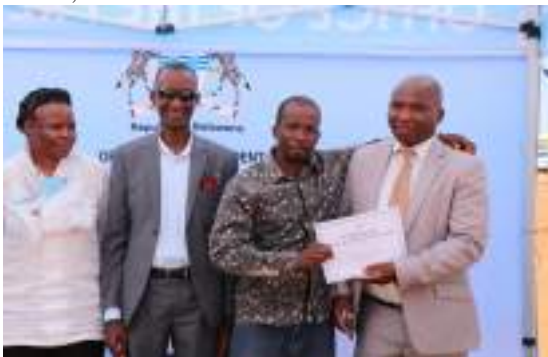
Town Mayor Molosiwa Molosiwa awarding graduating beneficiaries certificates in Selebi Phikwe

The graduations were combined with expos for those whose businesses are doing well as a way of helping them reach out to the wider market. Some of the beneficiaries previously packaged are now supporting government to assist others. For example, in Boteti 76 goats were bought from someone previously packaged. This also encouraged many who are benefiting from poverty programme.