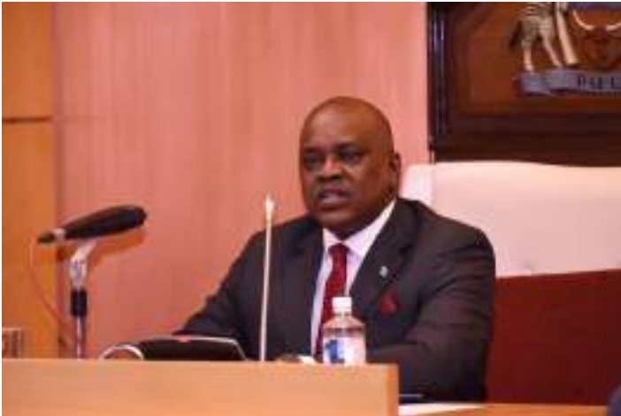
His Excellency Dr. Mokgweetsi Eric Keabetswe Masisi, President of Republic of Botswana